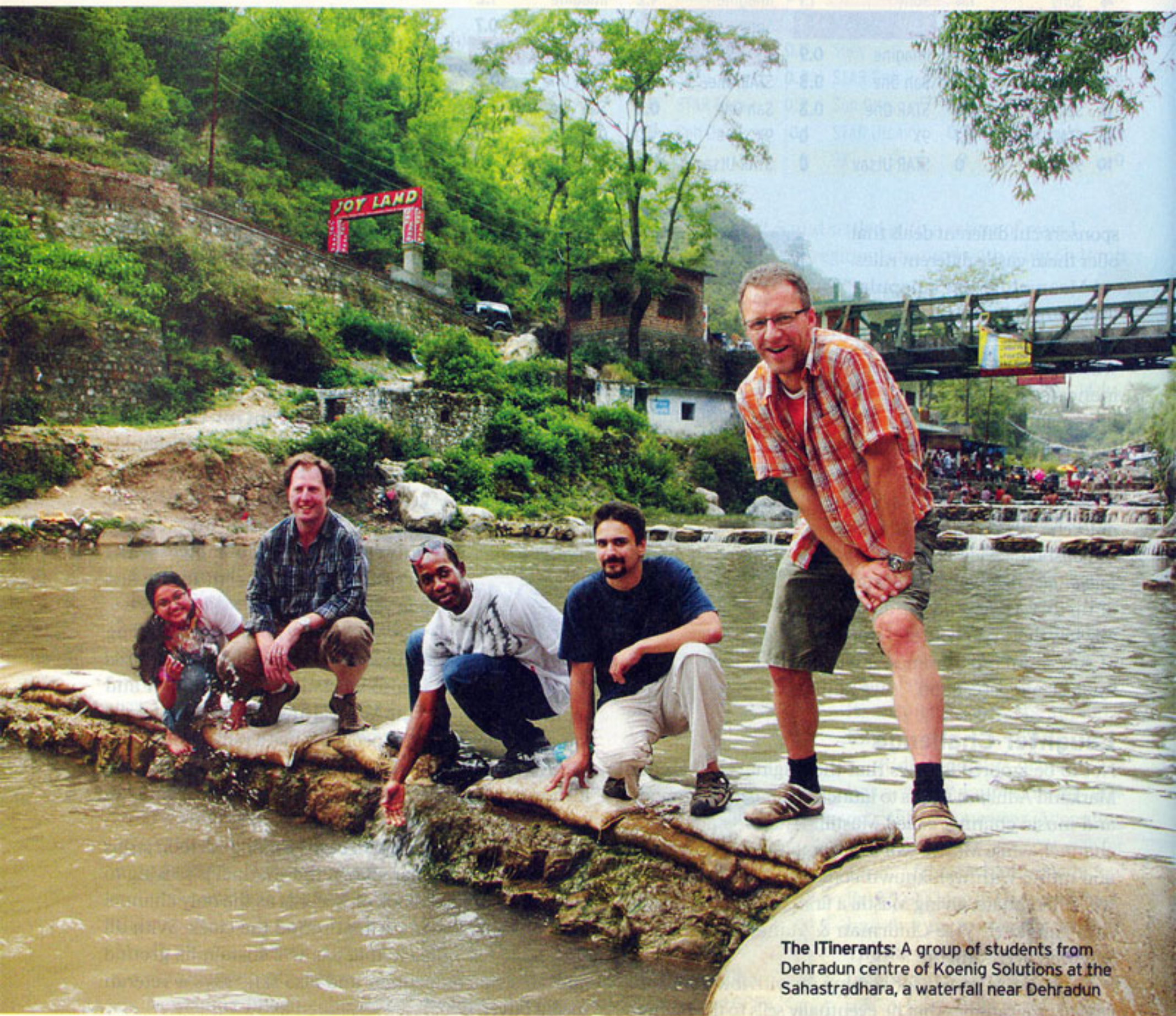
The ITinerants: A group of students from Dehradun centre of Koenig Solutions at the Sahastradhara, a waterfall near Dehradun

Koenig Solutions sits on a gold mine, offering a package of offshore tech certification and tourism to trainees from Europe to Africa. SAUMYA BHATTACHARYA